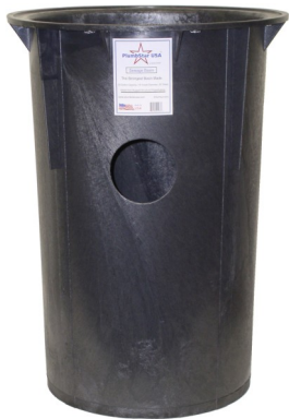
PSU1010 18" x 30" Sewage Basin