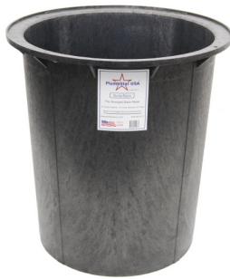
PSU1011 18" x 20" Sump Basin